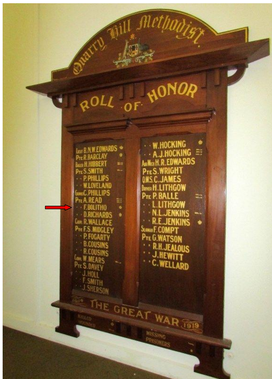
Quarry Hill Methodist Church Roll of Honor