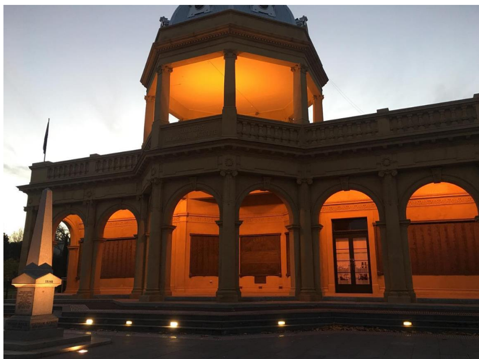
Soldiers' Memorial Institute, Bendigo