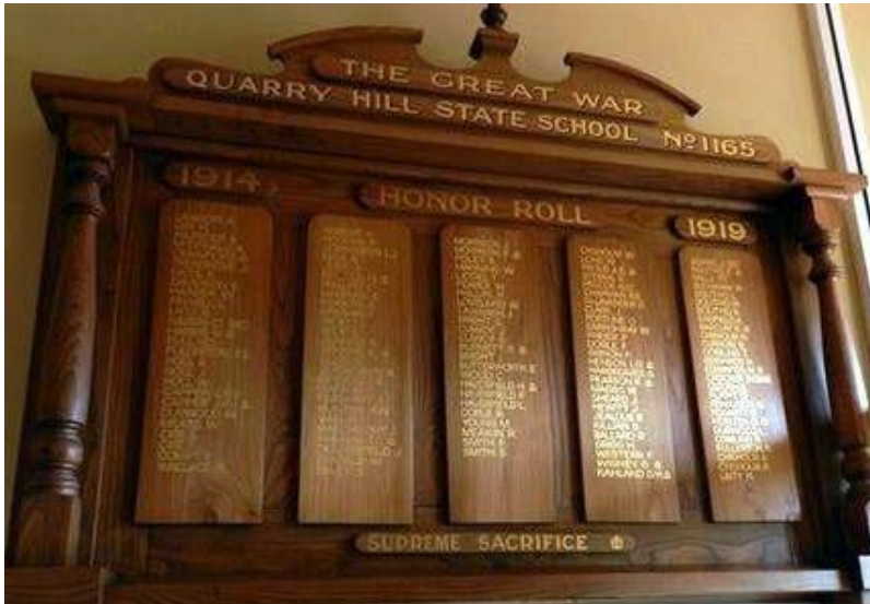
The World War I Honour Roll at Quarry Hill State School.