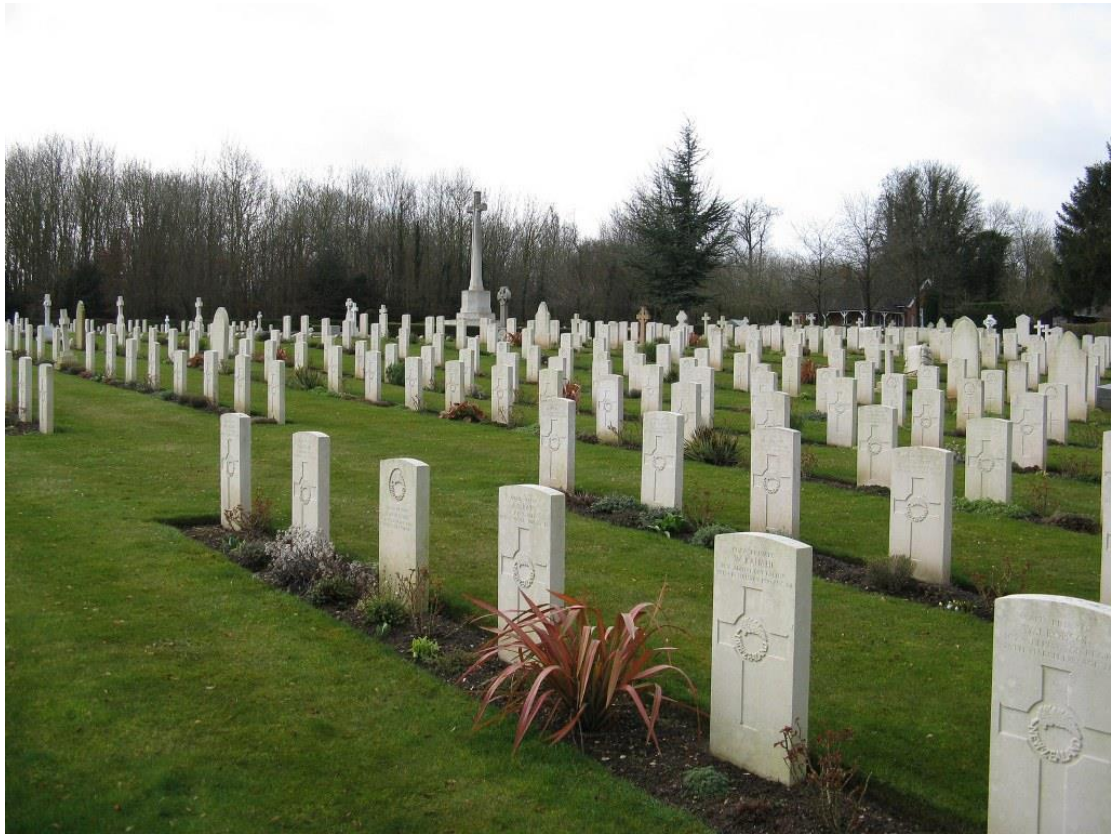
Tidworth Military Cemetery, Wiltshire